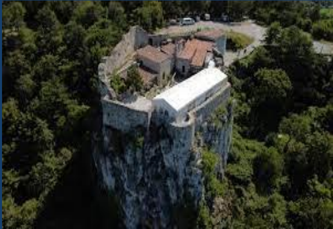
The Socerb castle: - it overlooks the sea

HERE ARE SOME SIGHTS FROM THOSE VILLAGES