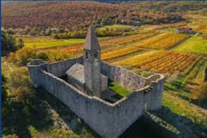
Church Sv.Trojica, from 15th century