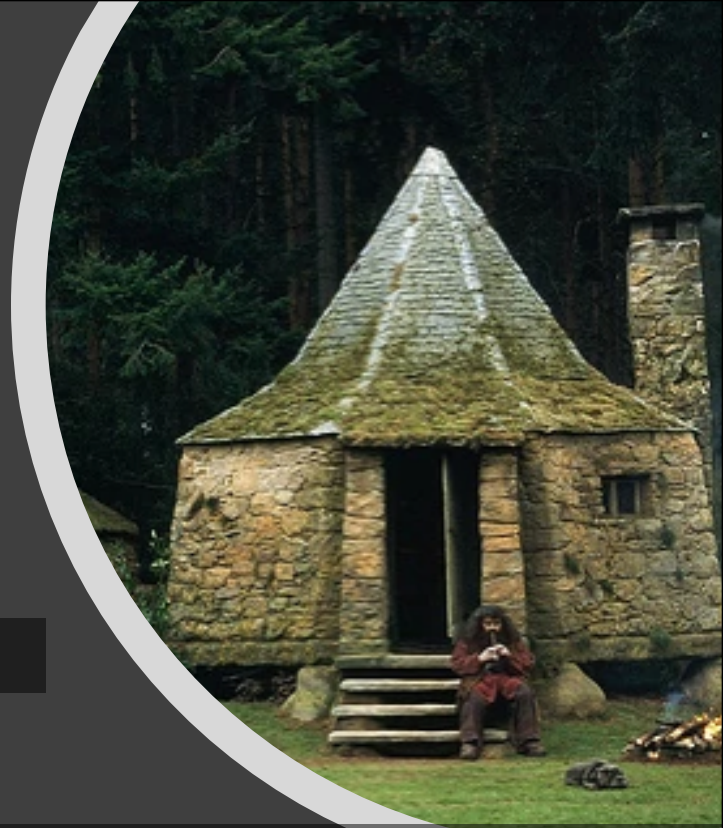
Hagrid's hut - north york moors