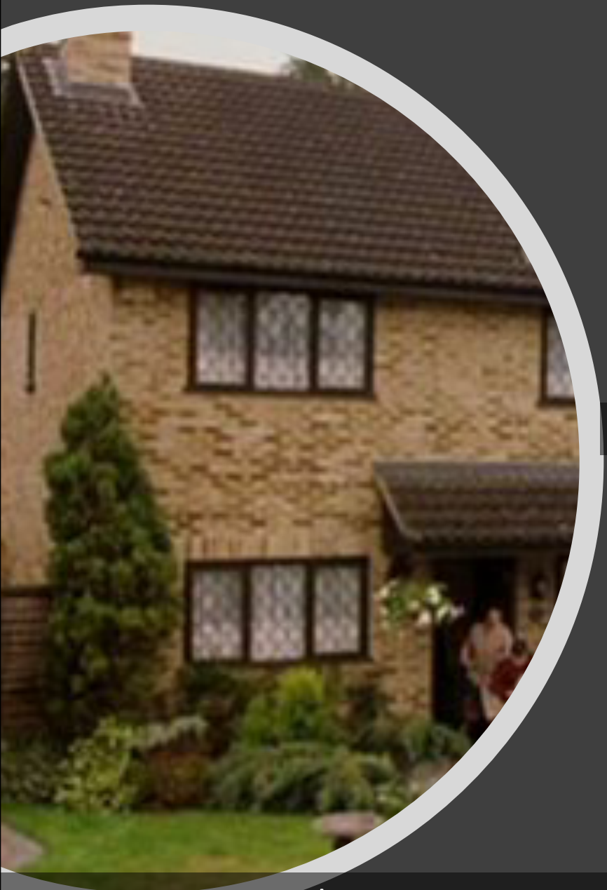
4 privet drive