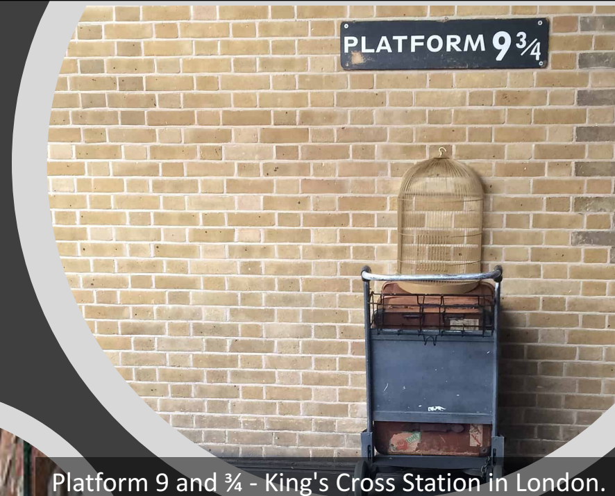
Platform 9 and \frac{3}{4} - King's Cross Station in London.