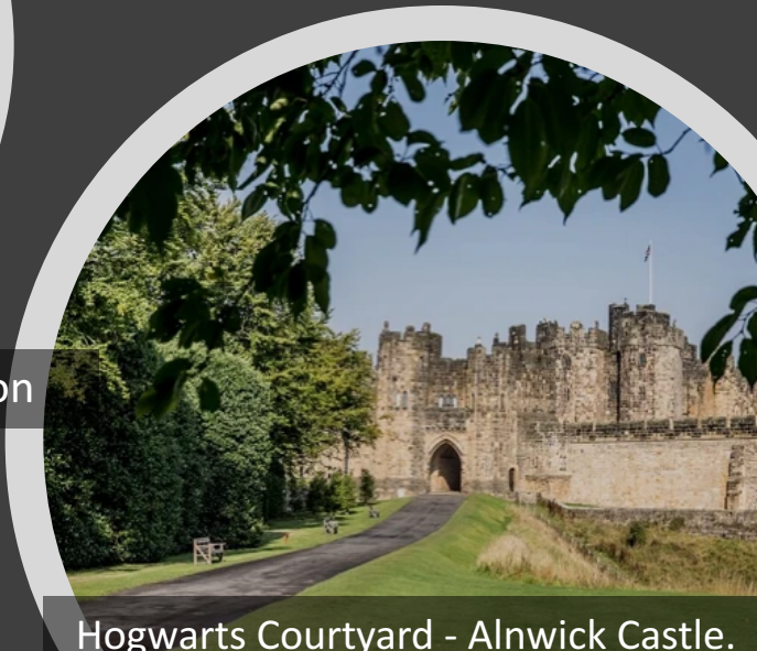
Hogwarts Courtyard - Alnwick Castle.